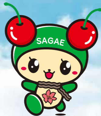
City Mascot "CHERRIN"

CHERRIN is a cherry fairy. Its birthday is on the third Sunday of June. The cherry on the right side of its head is a Satonishiki cherry, while the one on the left is a Benishuho. The pattern on its belly is of an azalea flower. CHERRIN also wears a soba noodle scarf that is changed to new soba noodles when a new season's buckwheat is harvested.